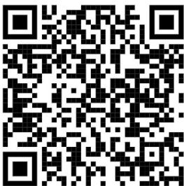
More Family Activities