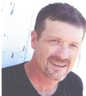
featuring Singer, Songwriter